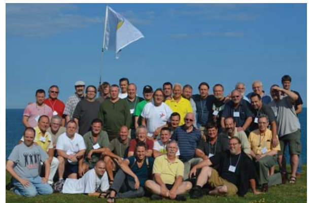
The 2013 Meeting of the Center Council. Men mentoring men into the future of MKP USA.

It's also important to recognize that, as in so many areas of our work, Unification is a process, an ongoing Hero's Journey into our shared future. As we move forward, we continue to trust the hearts and minds of good men ... and to 'trust the process,' pursuing our vision with wise action.