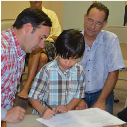
Ceremonial Signing of the Intent to Unify in Colorado

Begin setting the foundation for our next generation of growth in community. Identify. Connect. Organize.